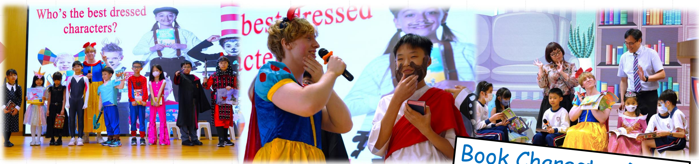
Book Character Day